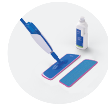
Cleaning kit QSSPRAYKIT