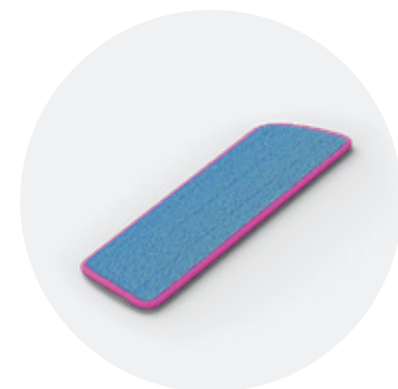
Cleaning mop QSSPRAYMOP