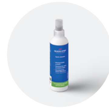
Spot cleaner 250 ML QSSPOTCLEAN