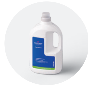
Floor cleaner 1 L or 2 L QSCLEANECO1000 QSCLEANECO2000