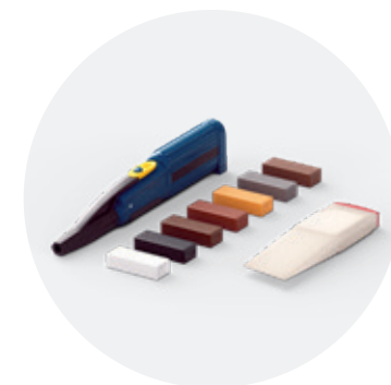
Repair kit QSREPAIR